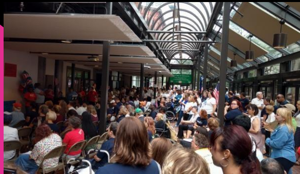
Syracuse, NY ADA celebration, 2018, inside the Atrium.

The Americans with Disabilities Act of 1990 or ADA (42 U.S.C. § 12101) is a civil rights law that prohibits discrimination based on disability. It affords similar protections against discrimination to Americans with disabilities as the Civil Rights Act of 1964, which made discrimination based on race, religion, sex, national origin, and other characteristics illegal, and later sexual orientation. In addition, unlike the Civil Rights Act, the ADA also requires covered employers to provide reasonable accommodations to employees with disabilities, and imposes accessibility requirements on public accommodations.