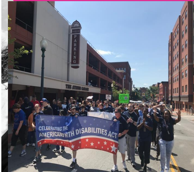
Central New York agencies who provide support & services to individuals with disabilities march through the streets of Syracuse together to celebrate and advocate for their rights as American citizens under ADA Law. (2019)