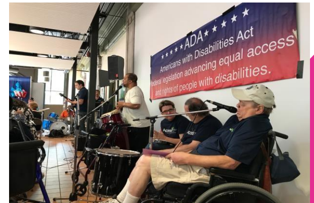
David Clark Learning Center Band

Access CNY, ARC of Onondaga, ARISE, Aurora of CNY, David Clark Learning Center, Disabled in Action of Greater Syracuse, Exceptional Family Resources, H.O.M.E., Inc., Liberty Resources, Onondaga Community Living, Onondaga County/Syracuse Commission on Human Rights, Self-Advocacy Association of New York State, Whole Me, Inc., and EPI-NY.